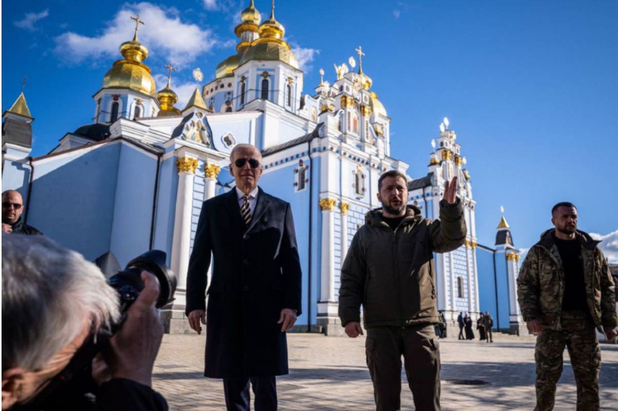
Volodymyr Zelenskyy meets Joe Biden in Kyiv

Before the anniversary of the Russian all-out invasion to Ukraine, the President of the United States of America, Joseph Biden, unexpectedly visited Kyiv. The trip of the American president was planned in the nearest future to Warsaw, however, after landing at the Rammstein Air Base, Biden continued his journey to Rzeszów and further to Kyiv.